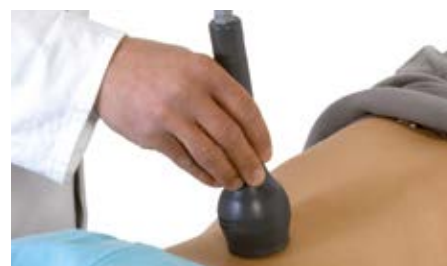
5- or 8-diode handpiece