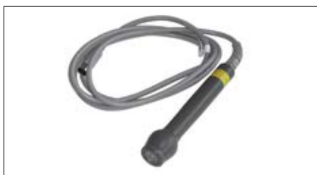
EL0028 1 DIODE HANDPIECE - 25MW EL0029 1 DIODE HANDPIECE - 50MW EL0030 1 DIODE HANDPIECE - 100MW

The laser handpieces have the possibility of automatic emission to approach the part to be treated or a continuous mode. In this case a support arm may be a useful accessory.