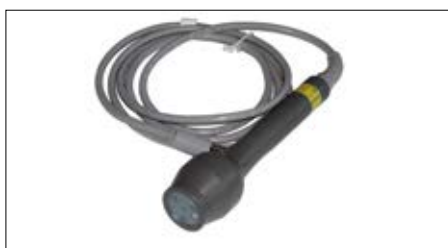
EL0034 5 DIODE HANDPIECE - 125MW EL0035 5 DIODE HANDPIECE - 250MW EL0036 5 DIODE HANDPIECE - 500MW