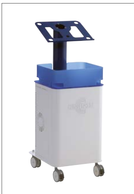
EL12003 TROLLEY Trolley with tabletop and possibility of fixing non wheeled electromedical equipment and the arms.