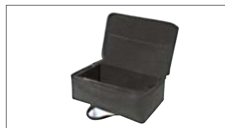
EL0016 CARRY CASE Universal carry case for transport of portable unit.