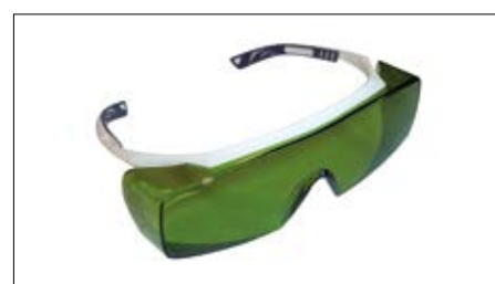
02098 LASER PROTECTIVE GOGGLES Lens color green, VLT 45%.